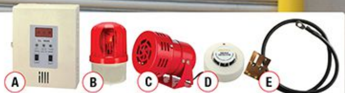
A- Control Unit B- Alarm Lamp C- Siren D- Smoke Detector E - Fuse Link cable