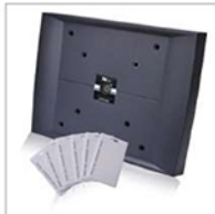
AR200U Mid Range Reader