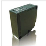
Safety IR beam