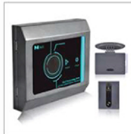
AR500U Long Range Reader